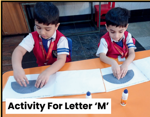
Activity For Letter 'M'