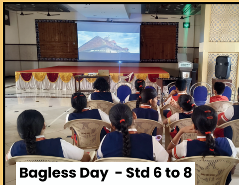
Bagless Day - Std 6 to 8